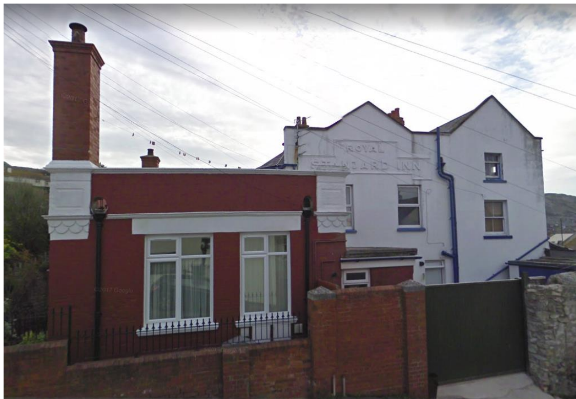
The Royal Standard Inn