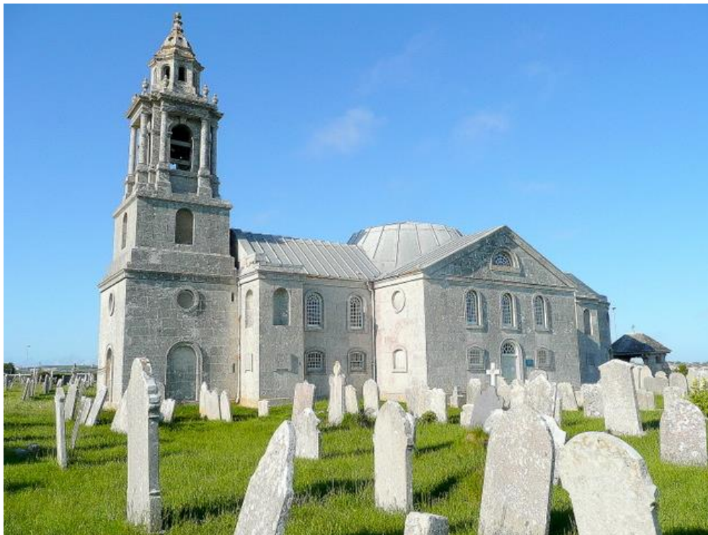
St. George's Churchyard, Portland

St. George's Churchyard, Portland contains 24 Commonwealth War Graves – 17 from World War 1 & 7 from World War 2.