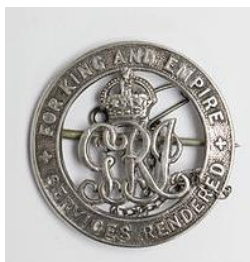
Silver War Badge

The Silver War Badge was issued in the United Kingdom and the British Empire to service personnel who had been honourably discharged due to wounds or sickness from military service in World War I. The badge, sometimes known as the "Discharge Badge", the "Wound Badge" or "Services Rendered Badge", was first issued in September 1916, along with an official certificate of entitlement. The large sterling silver lapel badge was intended to be worn on civilian clothes.