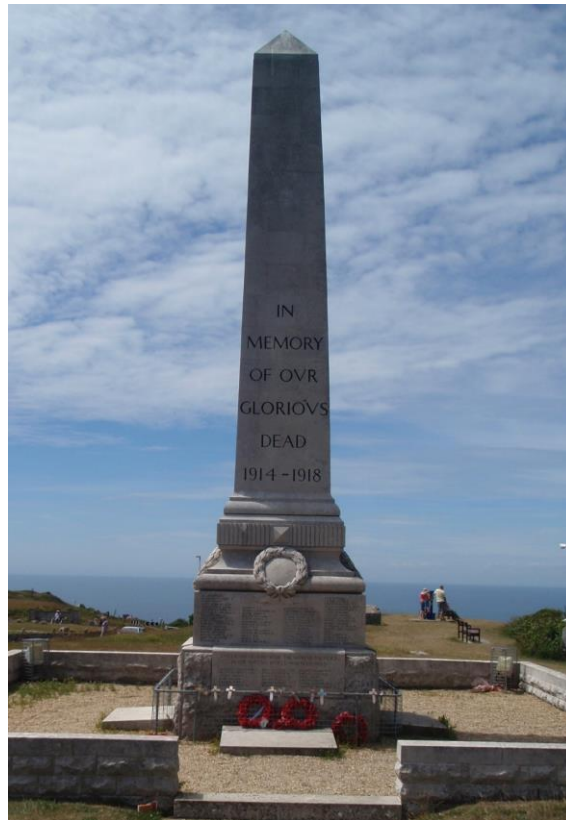
Portland War Memorial